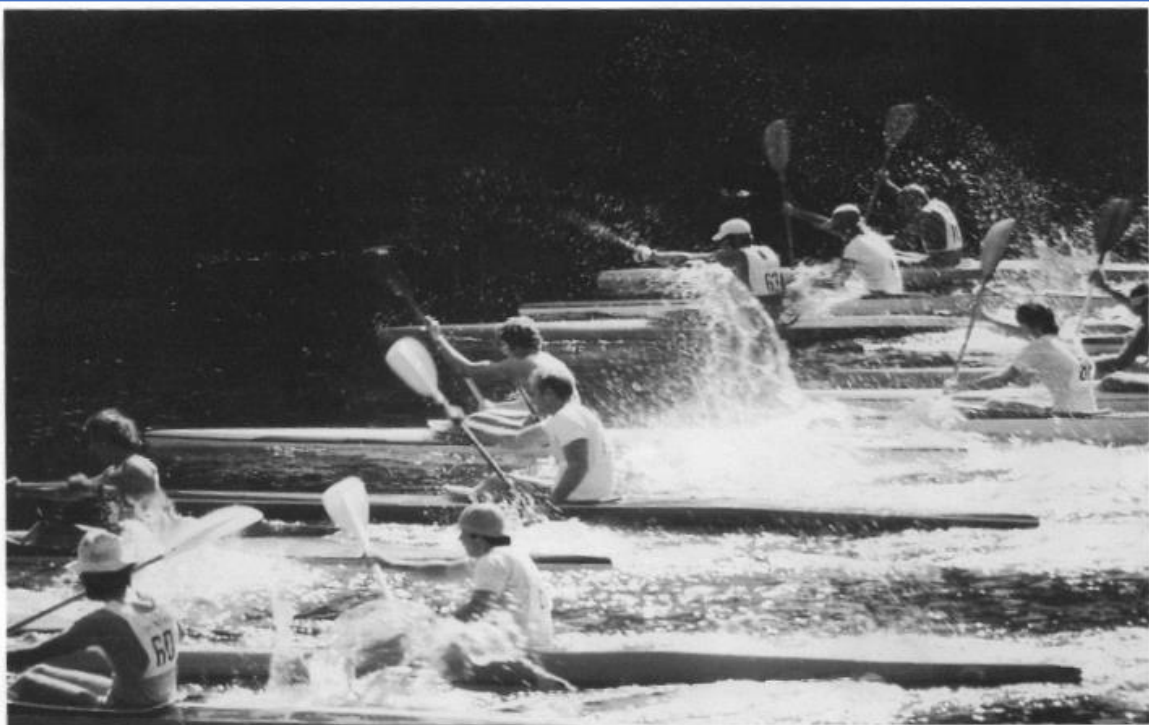
Start of Port Hacking Classic - 1980