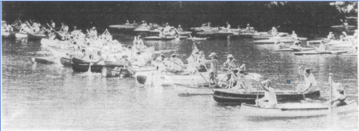
Start of Port Hacking Classic - 1970